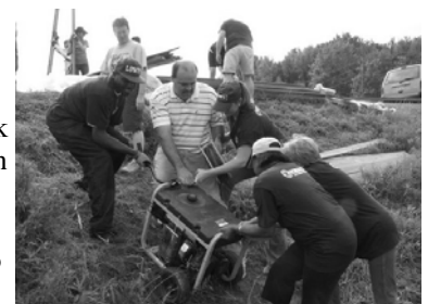
Lowe's employees donating time for Earth Day

participants experienced hands-on ownership in making efforts toward environmental stewardship by assisting in building a boardwalk and conducting an exotic plant pull around the William Bartram Rain Garden. Volunteers extended the Rain Garden boardwalk by 82.5 feet, and removed five truckloads of exotic Sea Myrtle. This new approach represents environmental stewardship in action and adds to the Academy's continued commitment to Earth Day's ideals of conservation and sustainable resources.