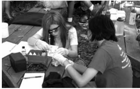
Students learn about dissolved oxygen in Academy field trip.

– the catalyst for realizing a competitive edge in producing the researchers and innovators of tomorrow. It is quite impressive that the Academy’s education programs equip students with valuable skills necessary to succeed in a variety of academic subjects,