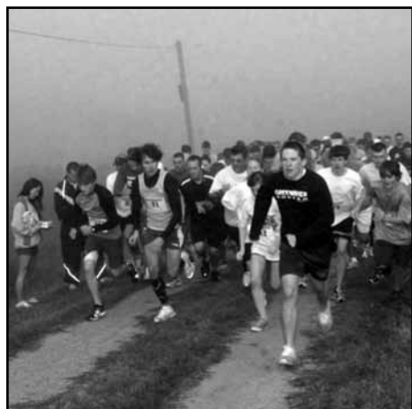
8th Annual Swamp Stomp 5K

In May, the Academy hosted the grand opening of its William Bartram Rain Garden boardwalk. The Academy recognized Lowe's Charitable and Educational Foundation and Augusta Utilities Department for their significant donations of $25,000 each, as well as other donors involved in this large scale project: U.S. Fish and Wildlife, George Thurmond Memorial, Wal-Mart (Bobby Jones Expressway), and Monsanto. In honor of the Grand Opening, all Swamp Saturday Hikes began from the Rain Garden Boardwalk. The William Bartram Rain Garden serves as a microcosm of an upper coastal plain swamp and showcases flora and fauna as seen by William Bartram during his travels through the area. The Rain Garden boardwalk provides a setting for students to safely explore swamp ecology in a supervised context. The rain garden also provides a venue for nature park visitors to experience the developing habitat.