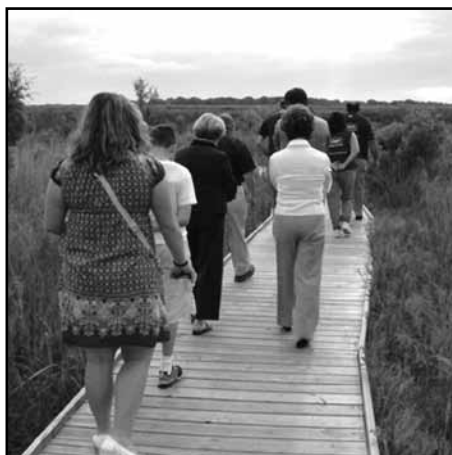
William Bartram Rain Garden Grand Opening