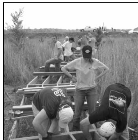
Volunteers extend the William Bartram Rain Garden Boardwalk