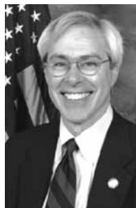
Congressman John Barrow