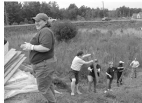
Elanco employees volunteer their time on the William Bartram Rain Garden.